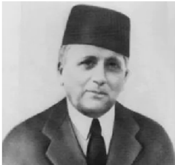
Shoghi Effendi, The Guardian of the Bahá’í Faith

Just as believers struggle to carry out their responsibilities toward the Bahá’í Fund, so do Assembly treasurers. Believers must conquer their fears and give sacrificially, but without hurting themselves or their dependents. Assembly treasurers, likewise, must draw a balance. They must conquer their fears and educate the believers, but without engaging in compulsion, which would harm the Fund and the community.